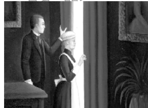
Axel and Martha the cook

Professor Lidenbrock came home early and he was very excited. He entered his room and looked at an old book. This was a translation of a famous Icelandic book. A piece of parchment fell out of the book it was written in runes. Professor Lidenbrock couldn't understand its writing. He called his nephew Axel who was his assistant. He told him that the book and parchment were not written in the same handwriting. He used a magnifying glass to make the letter bigger. He thought that the parchment was written by a famous Icelandic scientist called Arne Saknuessem who wanted to hide his discovery but professor Lidenbrock insisted on discovering the secret.