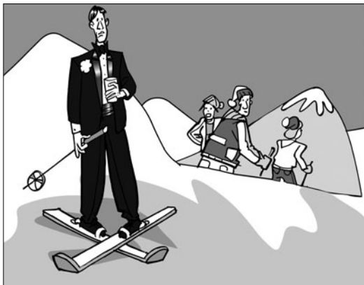
like a fish out of water

like a bump on a log Fig. completely inert. (Derogatory.) □ You can never tell what Julia thinks of something; she just stands there like a bump on a log.