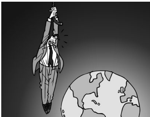
at the end of one's rope

2. Fig. when everything else has been taken into consideration.