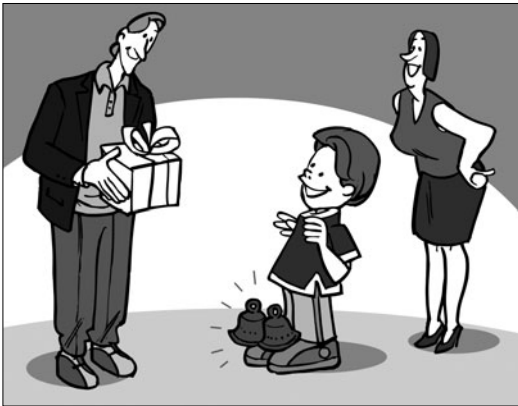
with bells on (one's toes)

or would happen. □ Hoping for a car as a birthday present is just wishful thinking.