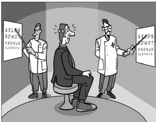
have eyes in the back of one's head

have one's finger in too many pies Fig. to be involved in too many things; to have too many tasks going to be able to do any of them well. □ She never gets anything done because she has her finger in too many pies.