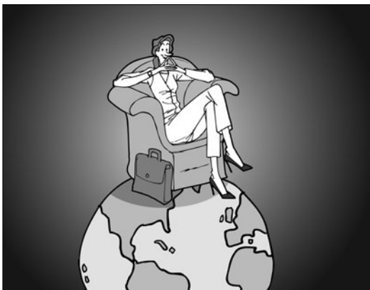
sitting on top of the world

noun.) □ The driver in front of me slammed her brakes on, and I nearly ran into her.