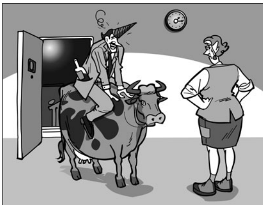
(un)til the cows come home

weather. 2. Inf. intoxicated. □ Daddy's had a few beers and is under the weather again.