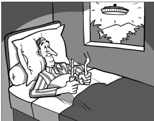
pie in the sky (sense 1)

plaster one's hair down † Fig. to use water, oil, or cream to dress the hair for combing. (The result looks plastered to the head.) □ Tony used some strange substance to plaster his hair down.