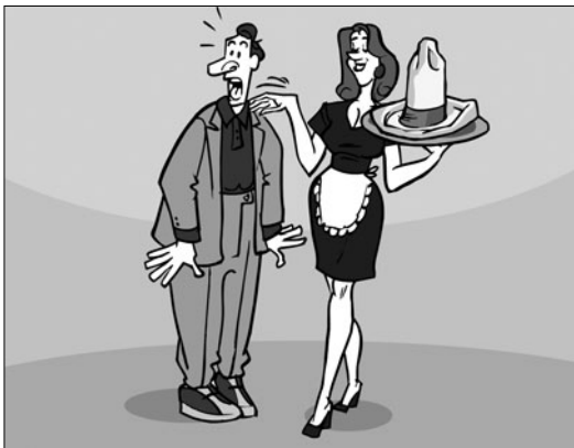
I'll eat my hat

I'll eat my hat. Fig. I will be very surprised. (Used to express strong disbelief in something.) □ If Joe really joins the Army, I'll eat my hat.