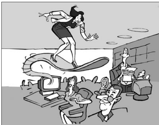
surf the Net

Sunday driver Fig. a slow and leisurely driver who appears to be sightseeing and enjoying the view, holding up traffic in the process. (Also a term of address.) □ I'm a Sunday driver, and I'm sorry. I just can't bear to go faster.