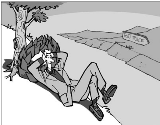
rest on one's laurels

right in the kisser Inf. right in the mouth or face. □ Wilbur poked the cop right in the kisser.