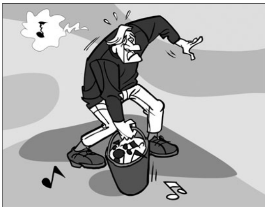
can't carry a tune in a bucket

cannot hear oneself think Fig. [a person] cannot concentrate. (Often following an expression something like It's so loud here. . . . ) □ Quiet! You're so loud I can't hear myself think!