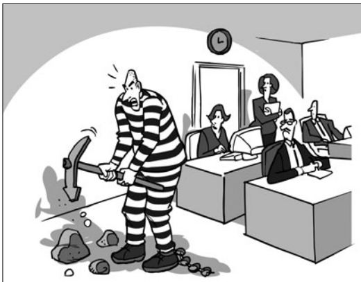
no rest for the wicked

nobody's fool Fig. a sensible and wise person who is not easily deceived. □ Anne may seem as though she's not very bright, but she's nobody's fool.